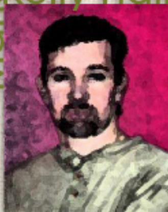
Mark Kelly Hall